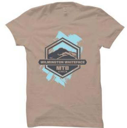
2018 retail shirt

Visit our retail tent throughout the weekend and check out our retail T-shirts (pictured), water bottles, trucker hats and more.