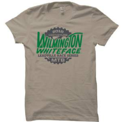
2018 participant shirt

Each athlete will self-position at the start line based on ability, with pros up front. 50K and 100K riders will start together. PLEASE be honest with your start location as it is a safety measure for all athletes! Space is first-come first-serve. Please do not leave your bike unattended in the start corral.